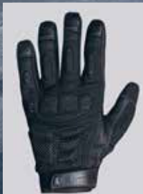
Gloves used: 119.2201

These gloves take care of you, so you can take care of your job.