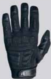
Gloves used: 119.2202