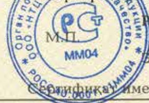
Схема сертификации: 3.

ДОПОЛНИТЕЛЬНАЯ ИНФОРМАЦИЯ Место нанесения знака соответствия: знак соответствия по ГОСТ Р 50460-92 наносится на ярлыки изделия и (или) в товаросопроводительную документацию